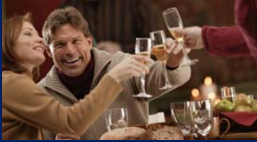
Italian in Venice